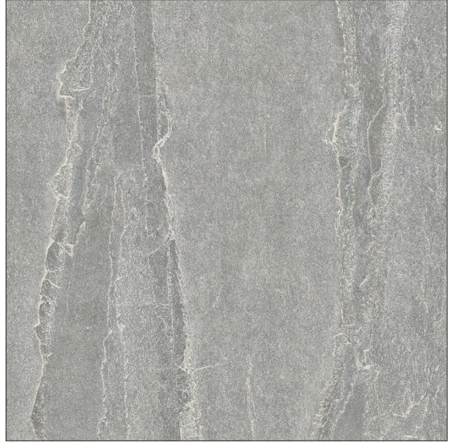
GREY Matte Finish Thickness: 9 mm

60 x 60 cm (24" x 24") HV.RM.LGR.2424.MT