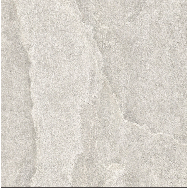
LIGHT GREY Matte Finish Thickness: 9 mm

60 x 60 cm (24" x 24") HV.RM.LGR.2424.MT